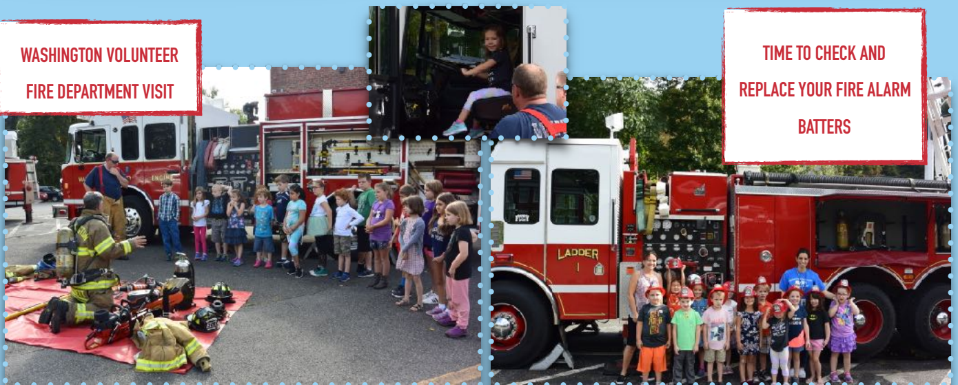
TIME TO CHECK AND REPLACE YOUR FIRE ALARM BATTERIES